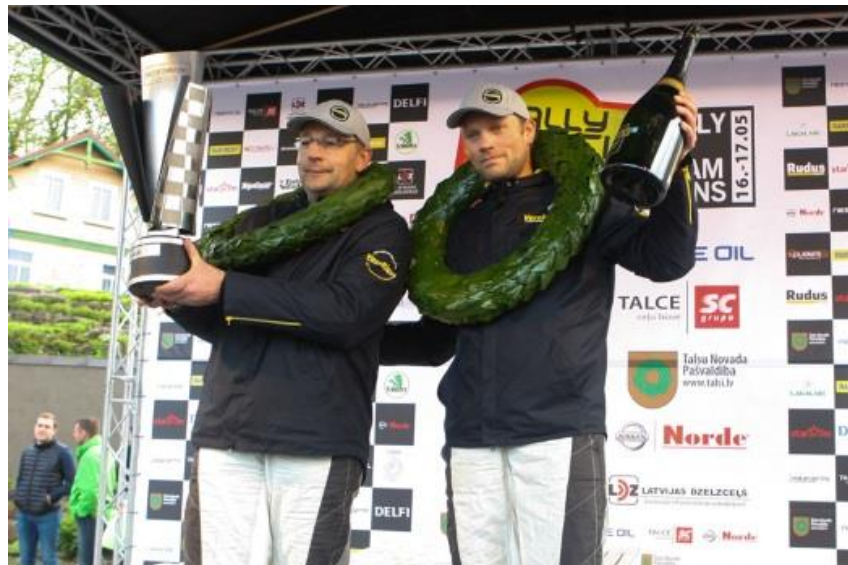
Champions' Challenge Cup winners 2015