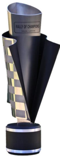
Champions' Challenge Cup

Since 2009 Rally Talsi bears a name of Rally of Champions and hosts a fierce competition for the Champions' Challenge Cup . The goal of the competition is to provide equal conditions for the N4 group champions of the previous rally season and sort it out, who is the fastest of them all. Rally of Champions has seen champions from the Baltics, Scandinavia, Belarus, Great Britain, Russia, Slovakia, and even from Kuwait. Moreover, Rally of Champions has seen competitors, who are now competing for the title of the World Rally Championship – Norwegians Andreas Mikkelsen ( Volkswagen Motorsport II ) and Mads Østberg ( M-Sport World Rally Team ), as well as Estonian Ott Tänak ( Dmack World Rally Team ). Who will outcompete others to bring home the glory and for a year also Champions' Challenge Cup ?